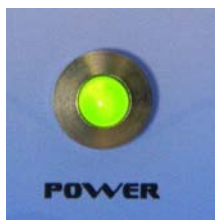
Easy visual check for operation